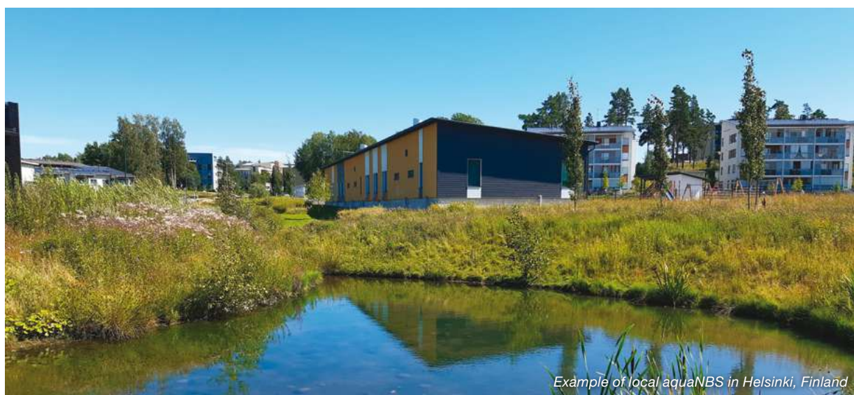
Example of local aquaNBS in Helsinki, Finland