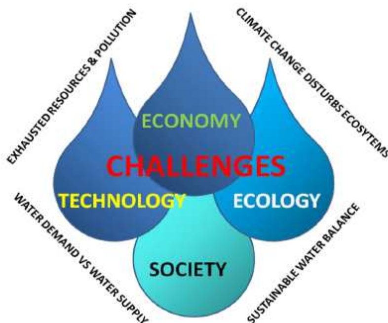
Figure 1. Drivers and multidisciplinary challenges to be addressed.

Addressing this challenge will require a multi-disciplinary approach, since economic, ecological, technological and societal challenges are to be addressed (Figure 1). The JPI will contribute to the challenge through coordination of National and Regional RDI policies and programmes.