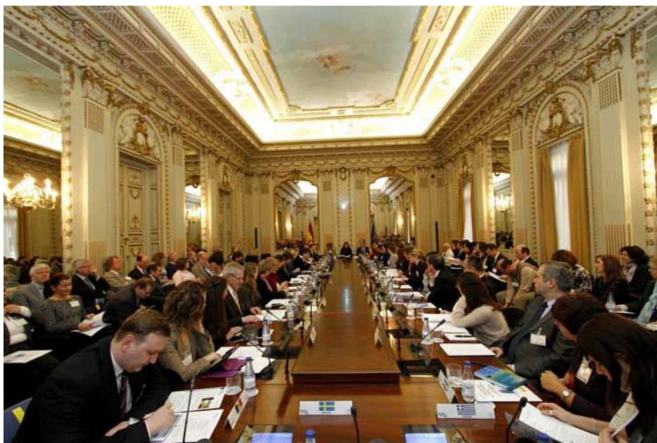
Photo taken at the WatEUr Kick-Off Meeting on 5 February 2013 in Madrid