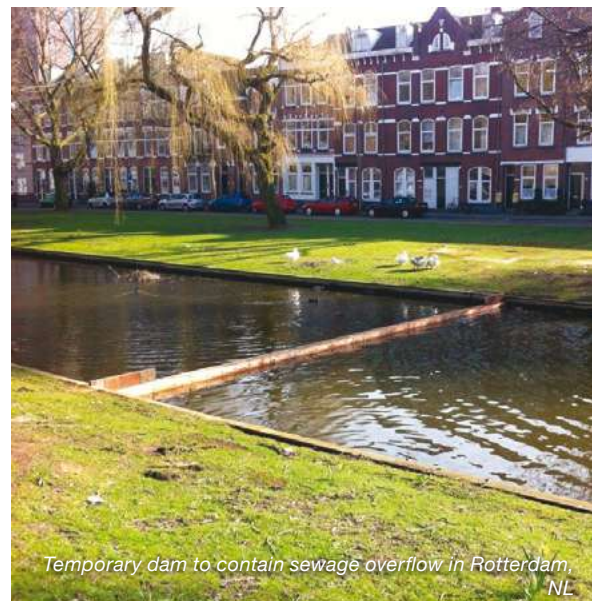
Temporary dam to contain sewage overflow in Rotterdam, NL