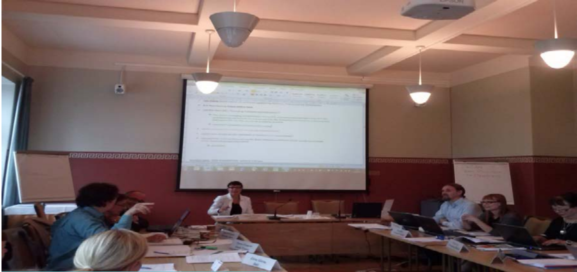
Participants in the Helsinki meeting

The draft documents to launch the imminent Pilot Call of the Water JPI were revised at the beginning of this month at a very well-attended meeting in Helsinki Agreement was reached on the deadlines and modalities of this important funding initiative agreed by the Water JPI partnership. The final decisions on this first common call funded by eleven organizations of eleven European countries will be made in a second meeting to be held in Venice on 9 October. A call preannouncement with more information is online on the Water JPI webpage!