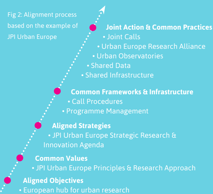
Fig 2: Alignment process based on the example of JPI Urban Europe