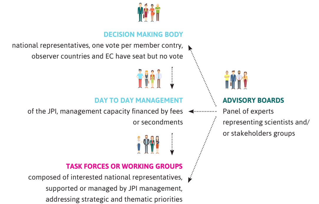
Fig 4: generalised governance model of JPIS

developed governance principles for sustainability, stakeholder orientation and open access as overarching guidelines for their mode of operations and for implementing their Strategic Research Agendas.