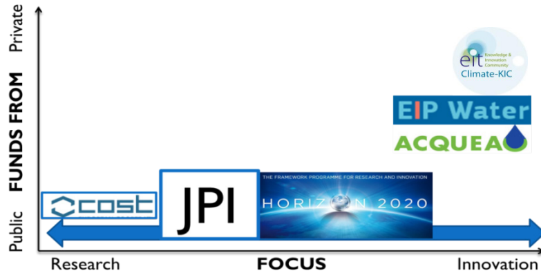
Figure 1. Selected agents in European Water RDI funding by focus and origin of the funds. (box size represents the centre of gravity of the initiative, not its funding volume).

Figure 2 separates the initiatives in the mapping space by introducing the funding target (public vs. private performers) in the ordinate axis. Horizon 2020 will increase funding to private performers as compared to FP7. The Water JPI will fund private performers, but in a lower fraction than Horizon 2020 is deemed to do. COST, largely targeting public performers, and the EIP on water, with a very strong interest towards private performers, are located on the extremes of the diagonal arrangement.