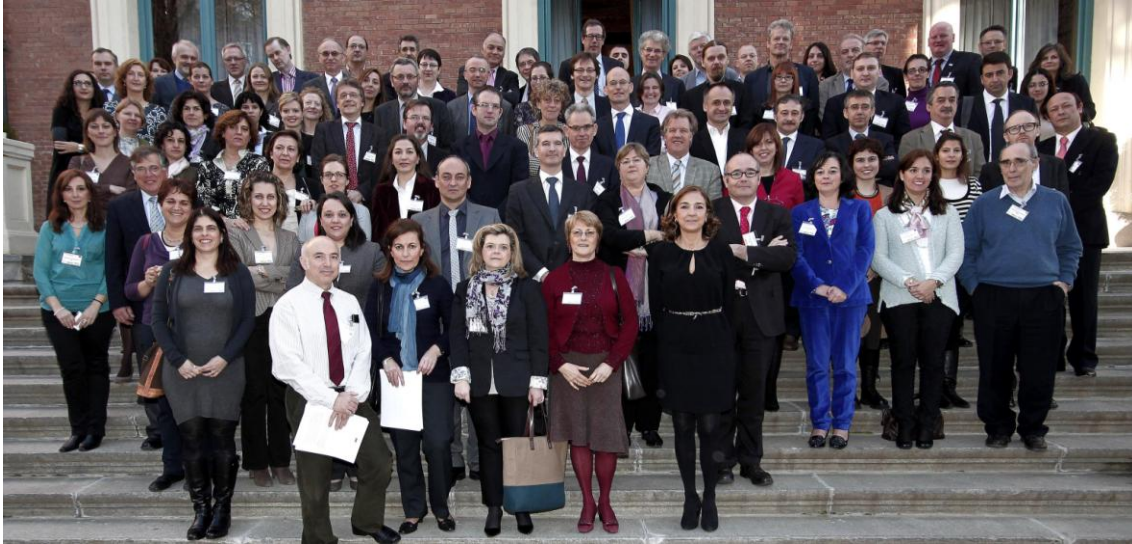
The Water JPI Community gathered in Madrid on February 2013.