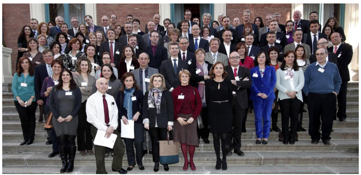
The Water JPI Community gathered in Madrid on February 2013.