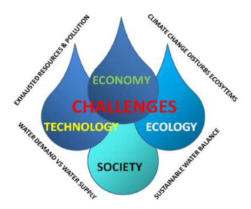
Figure 1. Drivers and multidisciplinary challenges to be addressed.

Addressing this challenge will require a multi-disciplinary approach, since economic, ecological, technological and societal challenges are to be addressed (Figure I). The JPI will contribute to the challenge through coordination of National and Regional RDI policies and programmes.