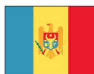
Moldova (Republic of)