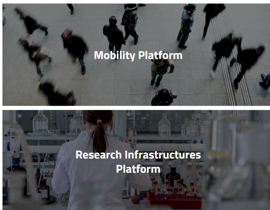
Figure 2 - Access to RI and Mobility sections

As it appeared important in previous discussions within the Water JPI, the Water JPI draft platforms are linked to other existing platforms, such as Euraxess and MERIL, or funding programmes (e.g. ESFRI). Therefore the draft homepage offers direct link with some of these programmes.