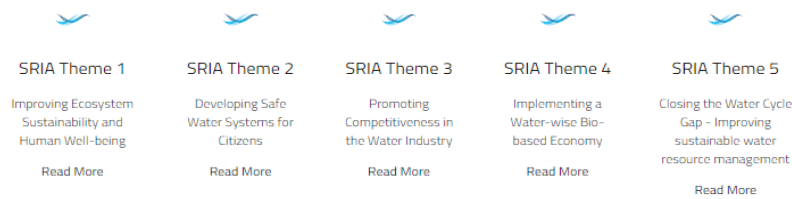
Figure 4 - Link with Water JPI SRIA Themes