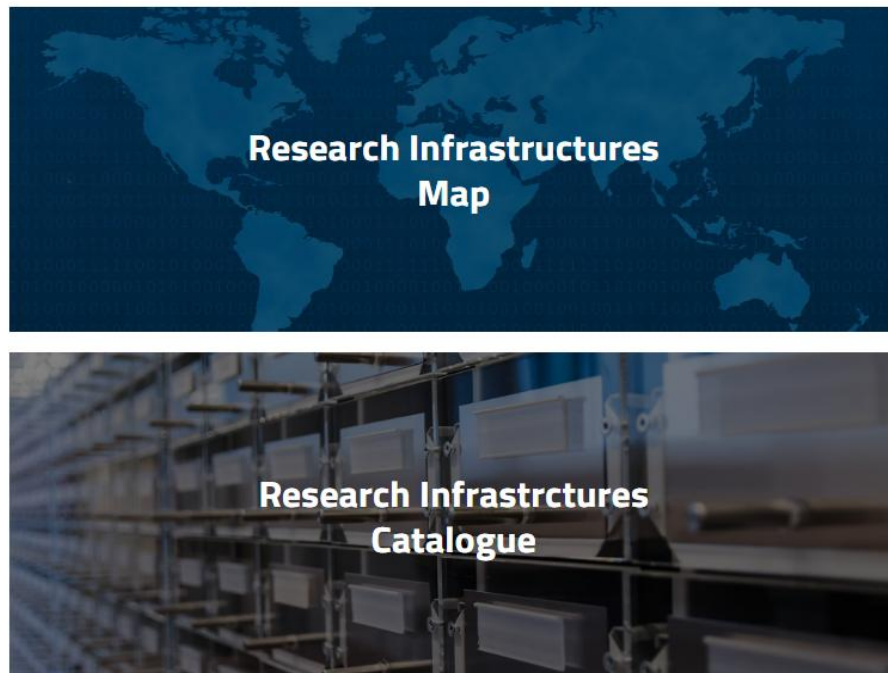
Figure 5 - Research Infrastructures section

Research Infrastructures section is designed in two main subsections