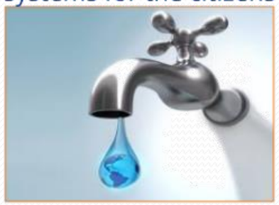
Developing safe water systems for the citizens