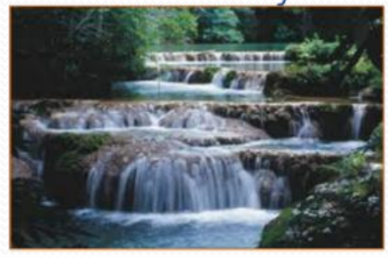
Maintaining ecosystem sustainability